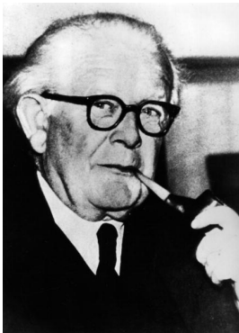
Jean Piaget 1896-1980